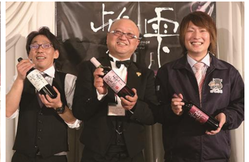
Members of the Suzumi-no-oka Winery