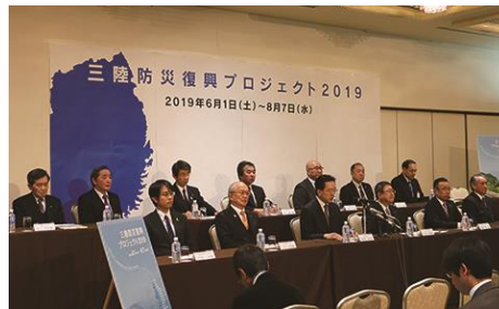
A press conference with Governor Tasso and local mayors

expand its operations to cover the entire coast from Kuji to Sakari (in Ofunato), the Great East Japan Earthquake and Tsunami Memorial Museum will open in Rikuzentakata, and Kamaishi will host two games in the 2019 Rugby World Cup. The number of people these projects attract is expected to provide a boost to the regional economy.