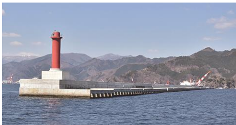
The completed northern section