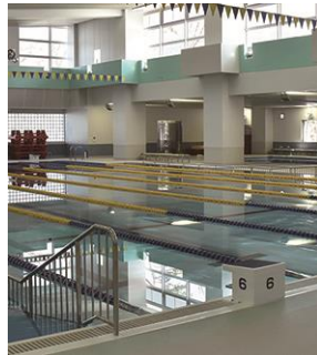
The 25-meter long heated swimming pool