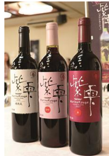
The wine bottles on display