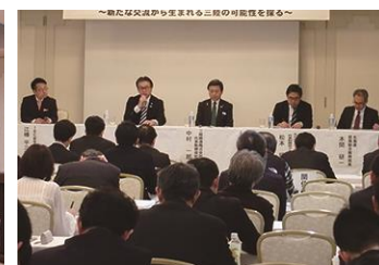
The panel discussion