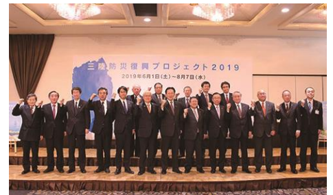
Governor Tasso and local mayors express their commitment