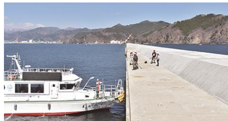
Reporters atop the northern section