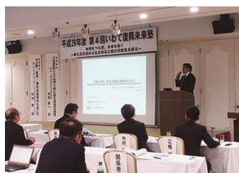
One of the keynote speeches