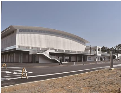
The newly opened Yume Arena Takata