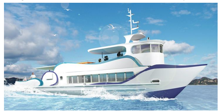
A rendition of what the completed ship will look like

The old docking bay suffered significant damage in the Great East Japan Earthquake and Tsunami, and has not sailed since. The ship had also grown old an unusable, but construction work on a replacement