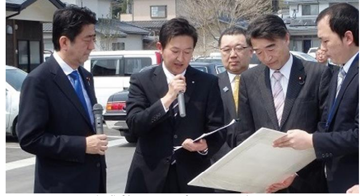
Prime Minister Abe (left) receiving information at the Monzen Kouji No. 2 Disaster Reconstruction Public Housing District

PM Abe (second from left) feeding the salmon fry at Tanohata's breeding facility