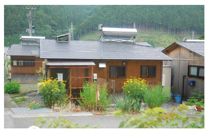
One of the houses due to be sold off

demolishing and moving one unit could cost over one million yen. In the matter that there is damage to the building and it is difficult to rebuild, assuming that there is a demand for it, they are willing to make arrangements to sell at a later date. They are working to support the survivors in rebuilding their lives.