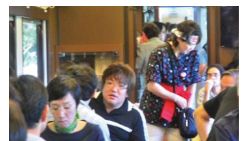
North-Sanriku ama attendants