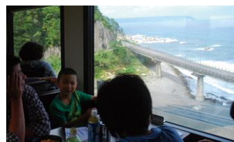
Picturesque scenery from the train