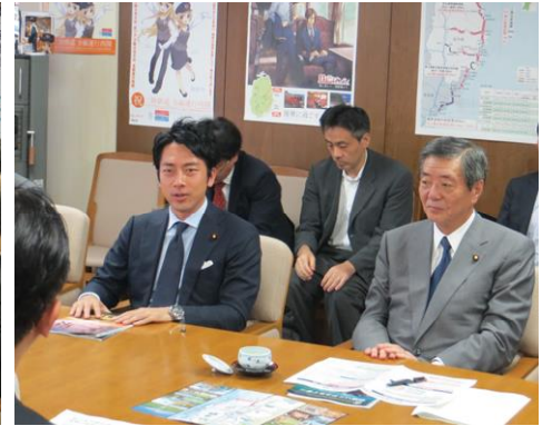
Reconstruction Minister Takeshita (right) and Parliamentary Secretary Koizumi (left)