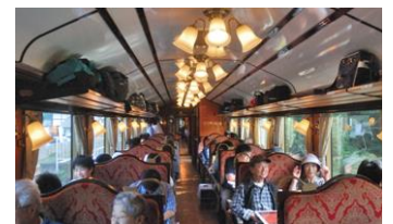
Inside a retro train

We are recruiting members for the Iwate Reconstruction Supporters Team!