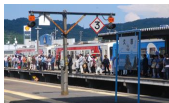
The bustling Sanriku-Kuji station

As a symbol of the reconstruction, the Sanriku Railway is not just a local means of transport, but also hope for local revitalization on the tourist front.