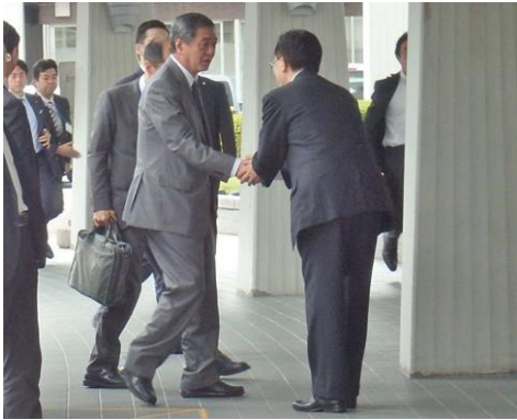
Governor Tasso greeting Reconstruction Minister Takeshita

In regards to reconstruction funds, Minister Takeshita said, "I will ensure that the essential amount of funds will be available," during the talk.