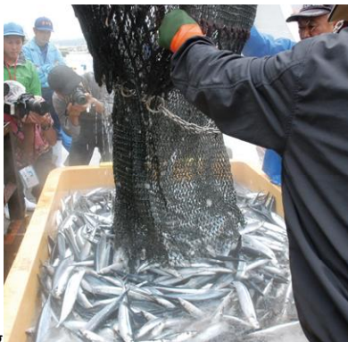
Sanma haul at the new fish market

The first sanma fish haul at the new fish market marks another step toward reconstruction for the fishing industry, and everyone involved is looking towards the future.