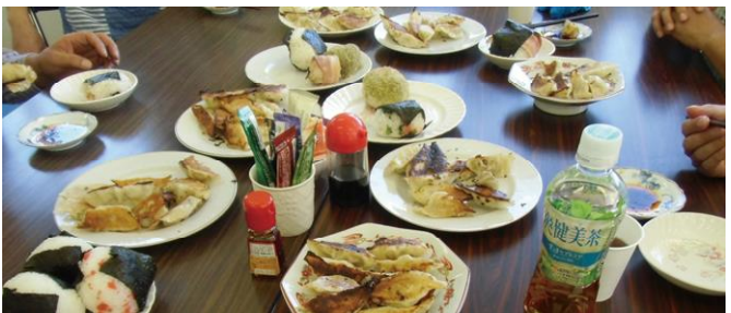
Flavored onigiri and Chinese dumplings made by the fathers and their kids

The next Papa-Ichi Cooking events will take place on November 10 (Sunday) and 23 (Saturday).