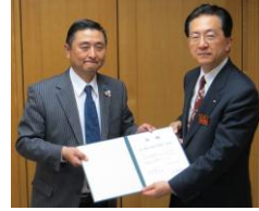
AEON Co. Ltd