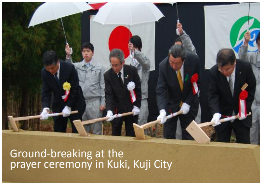
Ground-breaking at the prayer ceremony in Kuki, Kuji City

Many people in Japan have now heard of Kuji City through the broadcast of the NHK serial drama, "Ama-chan," which takes place in the city. On Thursday, April 18, construction started on mass relocation sites within the city as part of the Disaster Prevention in Fishing Settlements Initiative. There was also a ceremony held to pray for the safety of the project.