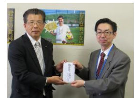
Shin-Yokohama Rotary Club

※ We have received aid from people both domestically and internationally that are not pictured here. We thank you all for your kindness and gratitude.