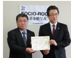
Mitsubishi Electric Corporation SOCIO-ROOTS Fund