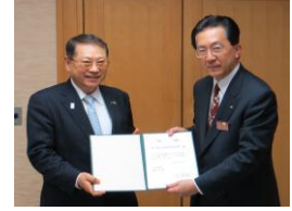
AEON Tohoku Shops Association