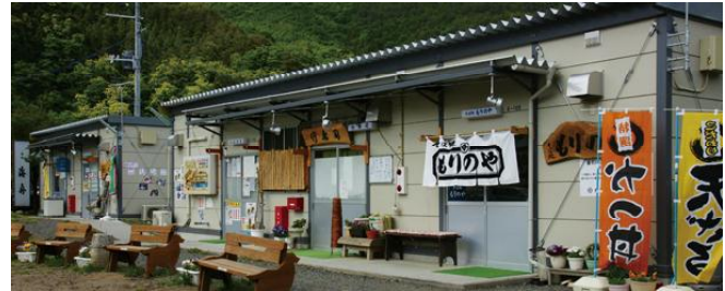
One building affected by this extension: Suzuko District Temporary Facility in Kamaishi

For any emergency temporary building with a location, purpose, and usage period set by the Reconstruction Promotion Plan: The existence period of the building may be extended within its planned period of use as long as a specified administrative unit confirms that the building follows safety, fire, and sanitary regulations.