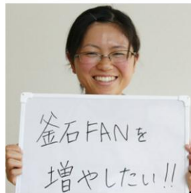
"I want to make more Kamaishi fans!"

The day after the Great East Japan Earthquake and Tsunami struck, she and a coworker left Hokkaido for Kamaishi. With the expressways closed, they were relieved to finally get to Kamaishi. Seeing the town