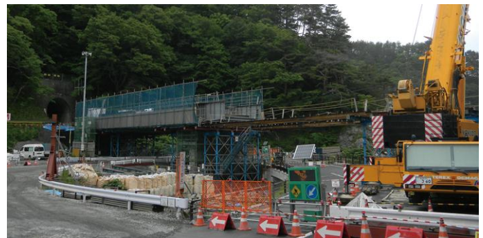
Work on the land bridge between Tanohata and Shimanokoshi Stations. ※The substructure is completed, and work on installing the beams has begun.

Works on the Sanriku Railway North Rias Line's Shimanokoshi Station, which lost both its main building and land bridge in the tsunami, continue in earnest. It is hoped that in April 2014, the currently inactive 10.5-km stretch between Tanohata and Omoto Stations will be fully up and running again.