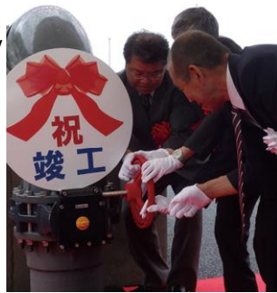
The completion ceremony in progress

Since the salmon catch is a key part of our fisheries industry, news that it is moving towards recovery is good news indeed.