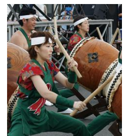
Yamaguchi Daiko performance