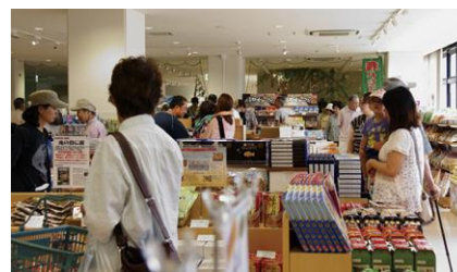
The bustling "Naado" shop

Reopening before the summer travel season, Seatopia Naado will become a tourism hub for Miyako once again, as well as serving as a "kitchen" for Miyako's citizens.