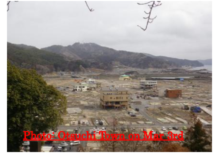
Photo: Otsuchi Town in Mar. 3rd

We hope that you will continue to support us in our efforts. Here is some of the latest news from Iwate.