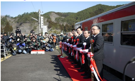
A ceremony was held on April 1 to celebrate the restart of operations between Rikuchu Noda and Tanohata Stations of Sanriku Railway Kita-Rias Line.

Sanriku Railway was damaged extensively due to the tsunami as some of the station buildings and tracks were swept away by the tsunami. Despite the huge scale of the disaster, railway operations were partially restored just 5 days after the disaster, with the policy of 'starting the restoration from wherever they could'. The train operations were resumed gradually, but 2/3 of the track was still out-of-service.