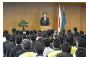
Governor Tasso addresses the newly dispatched staff

Iwate welcomed 139 new staff members from 33 different local governments including 4 designated cities. Governor Tasso in his speech encouraged the new staff to 'work hard for Iwate's speedy recovery from the disaster'.