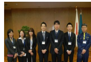
Newly appointed staff of the Reconstruction Bureau