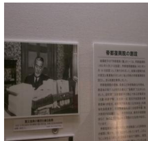
Goto, as the Head of the Imperial Reconstruction Institute

After serving as the president of Aichi Hospital and head of the Home Ministry’s medical bureau, Goto was appointed as the civilian governor of Taiwan by Gentaro Kodama, the Director-General of Taiwan.