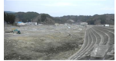
Taro District in Miyako City Photographed on April 11, 2012

We hope that you will continue to support us in our efforts. Here is some of the latest news from Iwate.