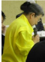
Chairperson Ito of the Iwate Dietitians Association

The following 5 organizations which are also members of this Committee, made presentations about their activities: Iwate Dietitians Association, Iwate Fisheries Association, Iwate Architects’ Association, Yamase Design Conference (NPO), and Iwate Kogyo Club; the presidents of these 5 organizations are also members of the Reconstruction Committee.