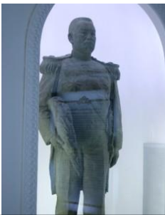
Shinpei Goto’s Statue at the National Taiwan Museum

After serving as the president of Aichi Hospital and head of the Home Ministry’s medical bureau, Goto was appointed as the civilian governor of Taiwan by Gentaro Kodama, the Director-General of Taiwan.