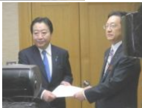
(Right) Governor Tasso presenting a formal request to the Prime Minister