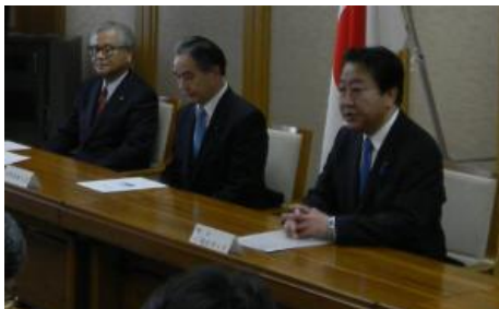
(Left) Meeting with Governor Tasso in the Prefectural Office: (from right) PM Noda, Reconstruction Minister Hirano, Vice Minister Kikawada

Following a conference with Governor Tasso in the Prefectural Office, the Prime Minister moved on to the disaster-hit coastal region. He inspected the Suehirochō shopping district and the cleanup of the debris in the Fujiwara Pier in Miyako, as well as Tarō area's seawall. He also inspected marine products manufacturers in Yamada Town's Funakoshi area, before engaging in a dialogue with the residents of the Orikasa temporary housing district, and directly listening to the opinions of the disaster victims.