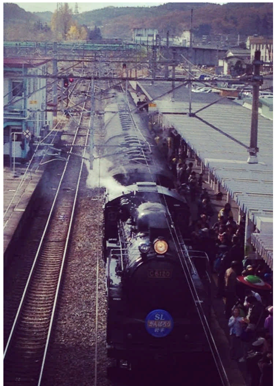
The 'Keep Fighting Iwate!' Steam Train preparing to depart Ichinoseki Station.

Along with the passengers, many locals and amateur photographers crammed along the train line to catch a glimpse, and were invigorated by the imposing figure of the train as it slowly yet powerfully moved forward trailing white steam. Who could not feel that the train represented Iwate's steady progress on the path to recovery?