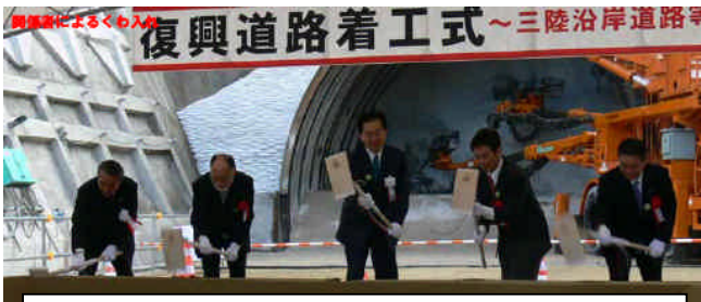
Ground-Breaking Ceremony for the 'Recovery Road'

A ground-breaking ceremony on Nov 20 marked the start of construction on a 'Recovery Road' in Tanohata Village.