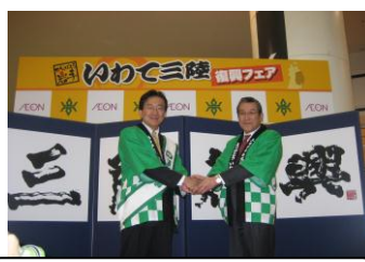
The Iwate Sanriku Reconstruction Fair at Aeon Laketown Shopping Center