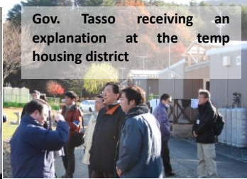
Gov. Tasso receiving an explanation at the temporary housing district

The governor stayed in the temporary housing because he wanted to know how life truly was for the many survivors living there.