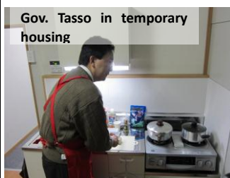
Gov. Tasso in temporary housing

On December 1, the prefecture held a round-table discussion with disaster survivors living in temporary housing in the Heita district of Kamaishi City. The talk was entitled, " Ganbaro, Iwate! Prefectural Government Round-Table Discussion and Opinion Exchange. " After the discussion, Governor Tasso visited temporary housing in the area and spent the night.