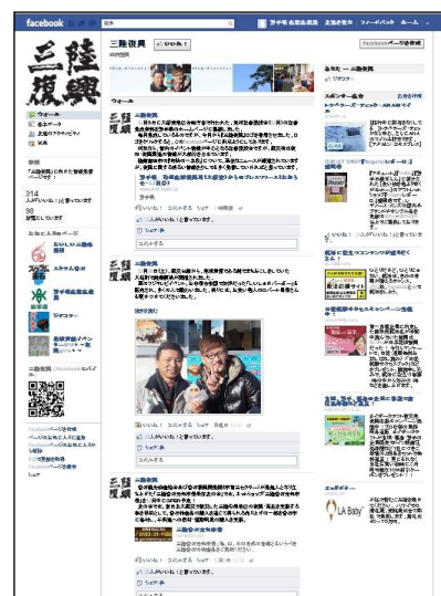
>>>Sanriku Reconstruction Facebook Page http://www.facebook.com/iwate.sanrikufukkou