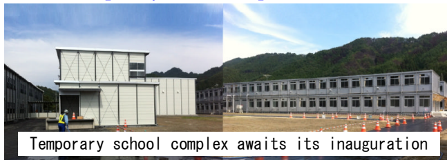
Temporary school complex awaits its inauguration

【Road to Recovery】 A total of 5 elementary and junior high schools from Otsuchi-cho will soon move to their temporary school complex.