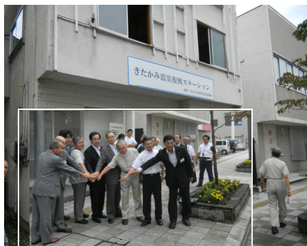
The representatives of member organizations and collaborating organizations at Recovery Station's inauguration.

Kitakami Recovery Station opened on 1 st of September, which would serve as the hub of disaster victims' relief efforts and recovery of the disaster-hit areas. This aid & relief center was set up in front of Kitakami Station because of its geographical location, as this area is a connecting point between the coastal and inland areas.