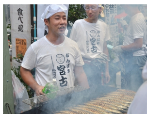
A Token of Appreciation: Sanma Feast

The annual "Meguro Sanma (saury fish) Festival" was held on 4 th September at Shinagawa District in Tokyo. Over 20,000 people visited the festival and enjoyed more than 7000 free charcoal-grilled sanma fish brought sent from Miyako City.