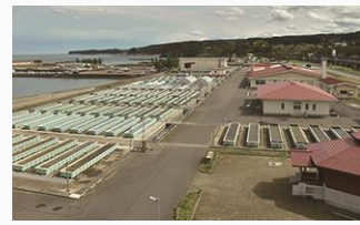
The reconstructed Iwate Aquaculture Cooperative Taneichi Offices (Photo: Iwate Aquaculture Cooperative Taneichi Offices)