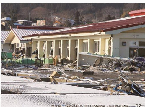
The damaged Iwate Aquaculture Cooperative Taneichi Offices

There have been independent disaster mitigation groups all across Hirono since before the disaster. These groups conduct various activities, including the weeding and maintenance of evacuation routes, and the installation of signs displaying elevation above sea level. There is a day-to-day awareness in Hirono that people must evacuate if a tsunami hits, and it's thanks to this awareness that there were no casualties in the disaster.