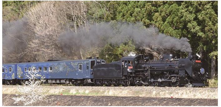
SL Ginga on the tracks

Depart Hanamaki 10:37 - Arrive Kamaishi 15:07 Depart Kamaishi 10:55 - Arrive Hanamaki 15:20