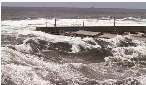
The huge tsunami hitting Hirono

What happened that day? In this section, we will be looking back at the disaster in each coastal town.