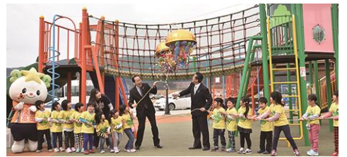
"Machinaka Square", a playground next door