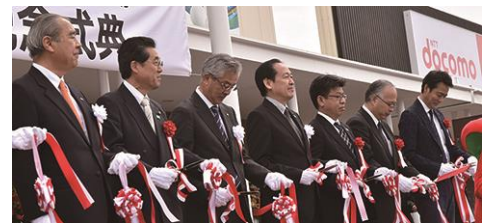
The ribbon-cutting ceremony