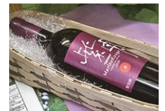
Wild Grape Wine "Shizuku"

The wild grapes from Noda Village are known for being extremely sweet, with a sugar content of 16-20 Brix. Wine made with these grapes is preserved and fermented in a former mining tunnel next to the winery to make an incredibly delicious product.