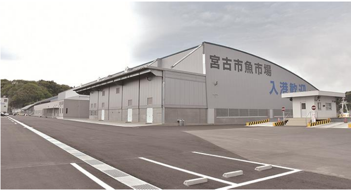
The completed expansion to Miyako Fish Market

The market provides around 90% of the prefecture's pacific cod, and is praised for the freshness of its products. It is hoped that the market's catch of salmon, Pacific saury, squid, and other fish will increase in the future.