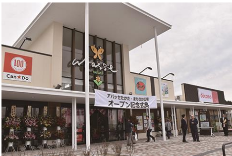
The newly-opened "Abasse Takata"

Six years on from the disaster, Abasse Takata is sure to become a busy new hub for the city.