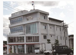
The newly-built Hirono Seafood Hall