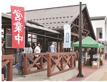
The officially re-opened Michi no Eki Rest Stop

【Business Hours】Shop ■ 8:30 - 18:00 Restaurant ■ 11:00 - 17:00 Café Space ■ 9:00 - 17:00 Address: Shimohei-gun, Iwaizumi-cho, Otomo 90-1 ☎0194-32-3070