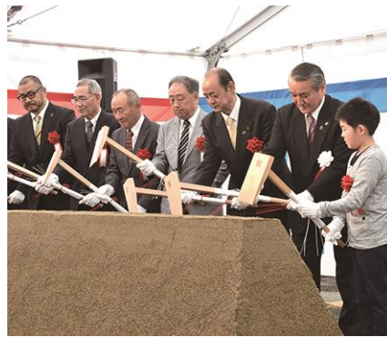
The ground-breaking ceremony

The stadium will be built on 9 hectares of elevated land. It will have 16,000 seats, of which 10,000 will be temporary. Construction is due to be completed in July 2018.