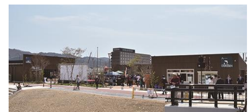
Kyassen Mall & Patio

The development of the shopping area in the square next to the station began in March last year, with the "1st Town Opening". Work is currently progressing on other projects, such as a local confectioner's factory shop due to be completed by the end of the financial year.