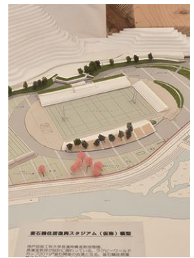
A model of the completed stadium