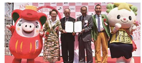
The town opening ceremony