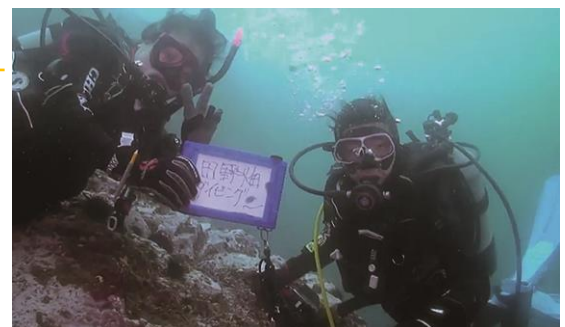
Diving at Tanohata

Inquiries: Tanohata Diving Service ☎ 0194-33-2881