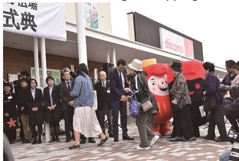
The opening day