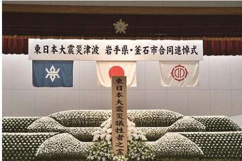
The decorated altar