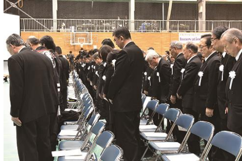
The attendees offer a silent prayer