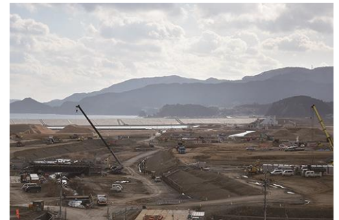
A view of the wall from above