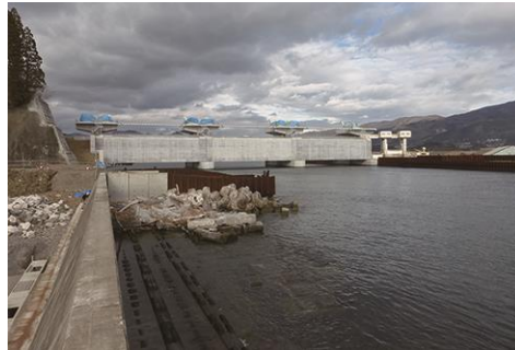
Construction of the floodgates in Kesen River