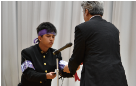
The leader of the cheer team receives the prize from the head of Mainichi Shimbun's Morioka branch