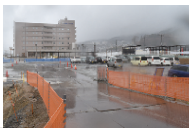
Construction work around Ofunato Station

There are plans on finishing construction on large commercial facilities by 2017, marking another step towards genuine reconstruction.