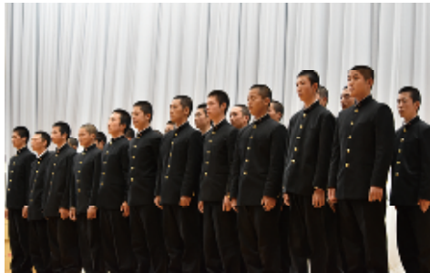
The baseball team onstage at the award ceremony