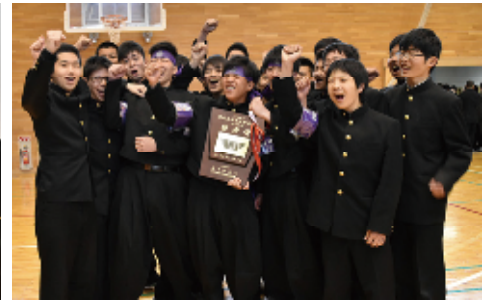
The happy, prize-winning cheer team