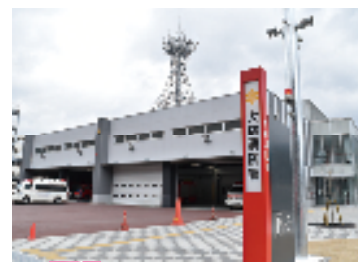
The new Otsuchi fire station

Kamaishi Fire Station, which was also destroyed during the disaster, has been performing its duties in its new building since April 2014.