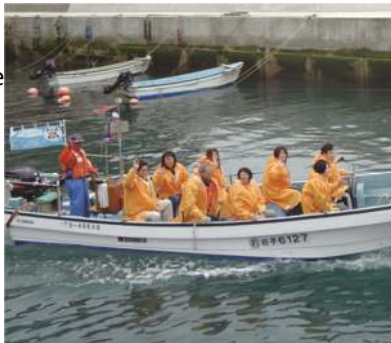
The popular Sappa Boat Adventure tour

Many tourists from both within and outside of Iwate came to visit during the festival. Along with the Sappa Boat Adventure tours, people were able to experience the day-to-day life of a fishing village through activities like making salt by boiling down salt water, and a cooking class which taught how to remove the shells of fresh sea urchins and sea squirts.