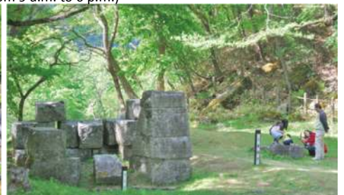
Hashino Blast Furnace No. 2