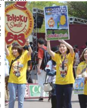
Fund-raising staff

Otsuchi plans to use approximately 12,000 m 2 of artificial grass to construct the "Otsuchi Children Green Field" (preliminary name). The field should be completed by March 2016.