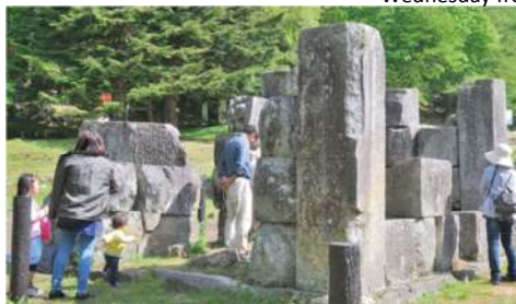
Hashino Blast Furnace No. 3